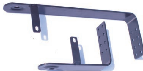
Lower Part Board Brackets 2pcs